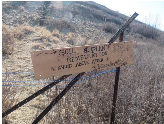
Newly Installed Sign and Barrier at base of Rehab Area