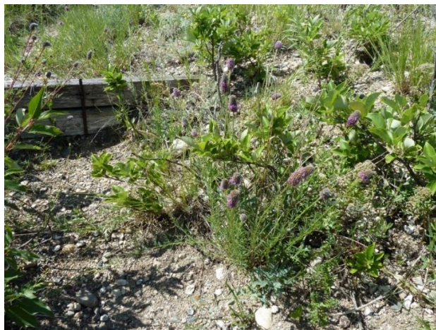
Small Dam and Re-establishing Vegetation in Gulley

Quite a few years ago a society work crew tackled the eroding gulley that was forming on the east facing steep slope not far south of our parking area. This erosion was started by human activity creating a trail, I was told it was from motor cycles riding up the hill, that then began to erode. The work crew created a series of small dams all along the gulley to catch eroding material and stabilize it. It has been very successful. Eroded material is no longer accumulating at the base of the hill. The gulley is slowly revegetating, which will help stabilize it. However, it would revegetate faster and be more stable if visitors didn't think the little dams made a great staircase to get up the hill. We even became aware of a website that referred to this as a "Stairway to Heaven" and encouraged people to hike up it.