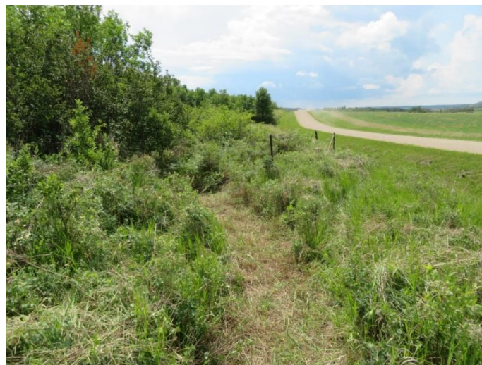
New Trail Leaving Parking Area and Heading through Shrubs and up the Ridge

The committee wants to encourage people to visit and appreciate Hidden Valley. We know many people are more comfortable if there is a marked trail. Also, we wanted an alternative trail so people would not walk up the rehabilitation area. In July 2019 the committee cut a new trail which heads west from the parking area and follows the ridge up to the top of the valley. This is a much easier pathway to reach the top than the steep climb beside the rehab area and is an excellent trail for wildflowers. We still need to build a gate at the fence and signage to mark the trail. Our intent is to mark this trail and do more cutting and mowing so there is a clear path up one ridge and then down the ridge east of the parking area. This will provide an attractive loop for people, with an option of going up or down the centre valley.